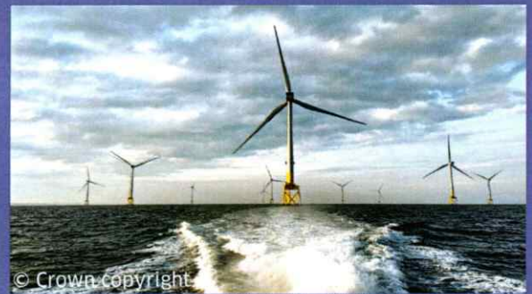
DRAFT SECTORAL MARINE PLAN FOR OFFSHORE WIND ENERGY - DRAFT PLAN OPTIONS

Only a proportion of each DPO will be able to be developed. It is not expected that all of the draft Plan Options will be developed.